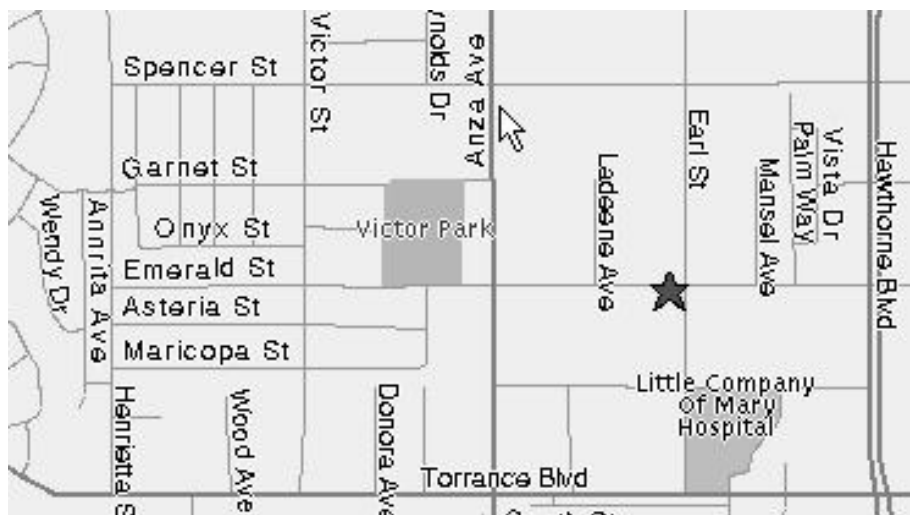
Salvation Army—4223 Emerald Street—Torrance