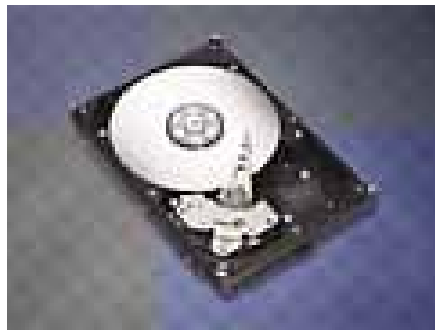
Barracuda 7200.8 Hard Drive

(megabytes per second), a standard cache of 8MB with an option for 16MB, an average seek time of 8ms, and a spindle speed of 7,200rpm. The drives also feature an areal density of 108Gb per square inch, a Seagate